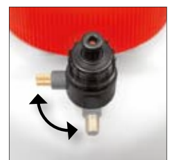
Optional accessory: Valve for external compressed air supply to avoid manual pumping