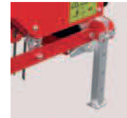
Storage legs for easy mounting and dismounting.