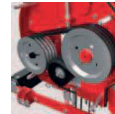
Belt driven for speed.